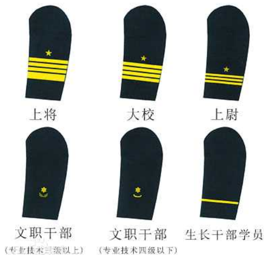
<Fig. 2> Armband

present the soldier’s rank; Collar flower can indicate the rank of the wearer as well. In addition, qualification chapter also has the function of grade marks. All these grade marks on military uniform can clearly reflect the wearer’s status.