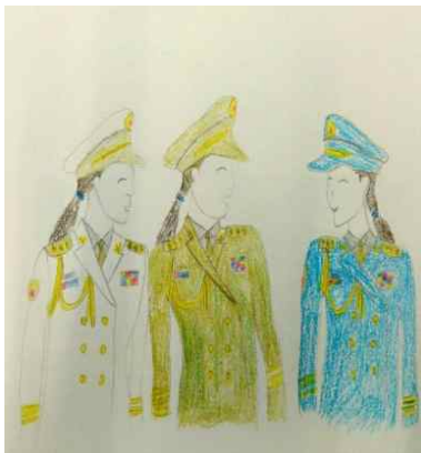
<Fig. 4> Female soldiers wearing aiguillette