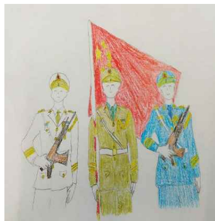
<Fig. 3> Male soldiers wearing aiguillette

There is an instructive anecdote in China about the woman Hua Mulan, who joined the army in lieu of her father, although female soldiers at that time were not in accordance with military provisions. Since it was only modern times that women were allowed to join the army, the basic military uniform profile is man's wear, which is stiff, majestic, powerful and serious, and at the same time must be convenient for military activities. Nevertheless, the phenomenon of “female dressed as male” also appeared in ancient times, during Tang dynasty, with the frequent exchanges with foreign countries, women have more freedom, and women dress Hu uniforms and man's clothing became popular at the moment. According to historical records, princess Taiping once dressed in man's clothing to remind her parents to find a partner for her.