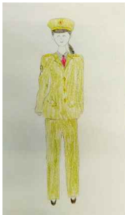
<Fig. 5> 87 Spring-Autumn informal dress (Suits with ties)