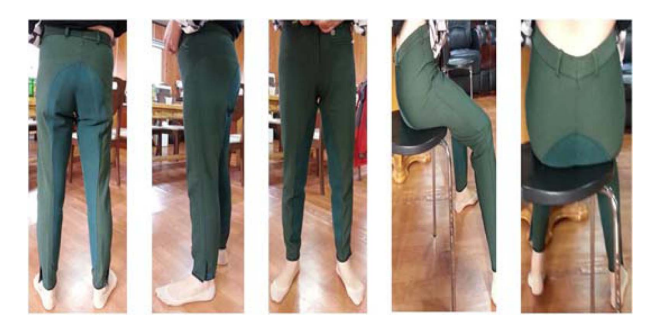
Photo 1. Buckle type locking equipments of horseback riding pants design.

sewing line and two kinds of designs on parts of hip and knee for experiment horseback riding pants manufactured in this study.