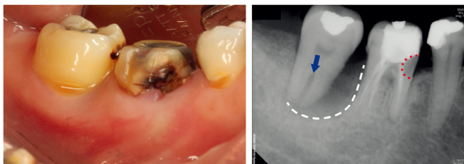
Case Module 2