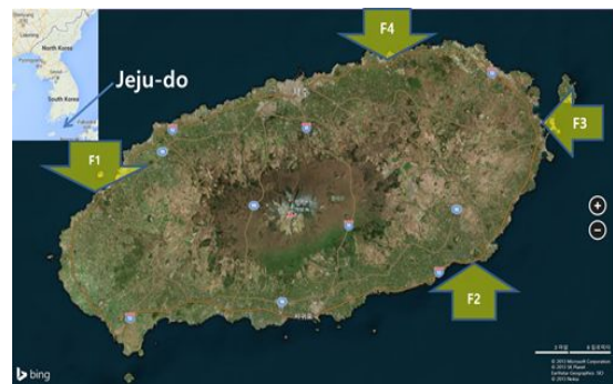
[Fig. 1] The study area in Jeju-do, Republic of Korea ; F1(west, Kudoa+), F2(south, Kudoa-), F3(east, Kudoa+), F4(north, Kudoa-)

The Jeju-do is located at the southern tip of the Korean Peninsula. The Jeju-do is in a temperate