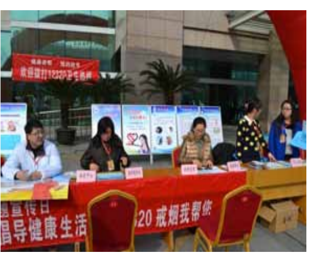
Public Propagating Activity