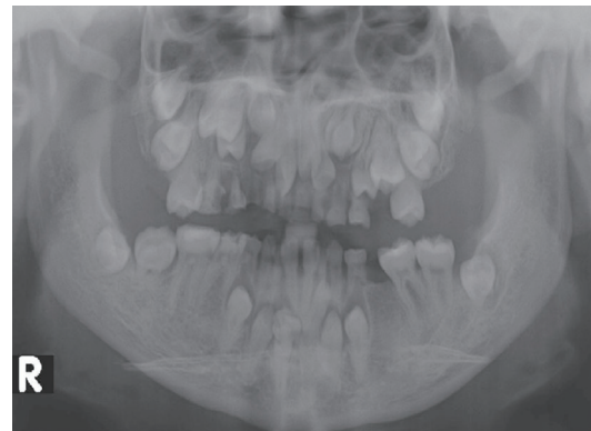
Fig. 4. Panoramic X-ray of dentition in Case 1. The deciduous dentition is retained, and much of the permanent dentition remains unerupted.