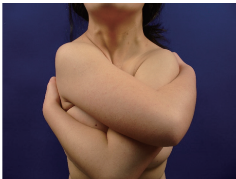
Fig. 2. The patient demonstrates shoulder joint hypermobility, which is a common clinical finding in cleidocranial dysplasia.