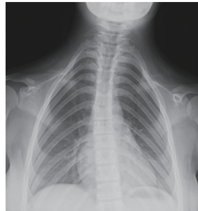
Fig. 3. Chest X-ray of the daughter patient shows narrow thorax with drooping ribs.