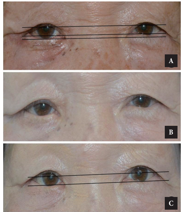
Fig. 3. (A-C) A 72-year-old woman with a right-sided orbitozygomatic fracture, which was treated via the subciliary approach. Photographs from the sequential follow-up visits.

adequate skin management with scar retraction (anterior lamellar insufficiency), laxity of the lower eyelid (laxity of the lateral canthal tendon or disinsertion), and middle lamellar inflammation and subsequent scarring. The lower eyelid is supported and suspended by the lateral and medial canthal tendons, capsulopalpebral fascia, tarsus, and orbicularis oculi muscles. It is subdivided into the anterior (skin and orbicularis oculi muscle), middle (orbital septum and orbital fat), and posterior (capsulopalpebral fascia and con-