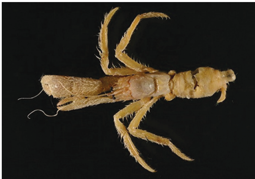
Fig. 1. Discorsopagurus maclaughlinae Komai, 1995 (male, sl 3.8 mm). sl, shield length.

do Prefecture, Wakkanai, Nosappu-misaki, 28 Mar 1990, gill net (20–30 m), coll., Sato O, HUMZ-C 976.