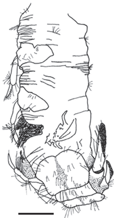
Fig. 5. Discorsopagurus tubicola Komai, 2003, female. Abdomen and tergites of fifth and sixth abdominal somite, dorsal. Scale bar=2.0 mm.