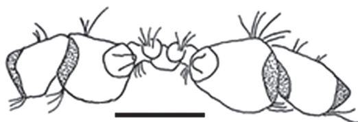
Fig. 6. Discorsopagurus tubicola Komai, 2003 (male, sl 4.64 mm). Eighth sternite, sexual tubes and coxae and ischia of fifth pereopods, ventral. sl, shield length. Scale bar=2.0 mm.

slightly convex; lateral and mesial margins with irregular row of small spines and tufts of stiff setae; dorsomesial margin with row of strong spines; dorsolateral margin with row of small spines; lateral and mesial margins and ventral surface with scattered tufts of setae. Carpus as long as merus, wide distally; dorsomesial margin not distinctly delimited, with 2 strong distal spines; dorsal surface with tufts of setae; lateral margin with row of spines. Dorsal surface of merus with tufts of long setae; ventral surface nearly flat, with a few tufts of long setae.