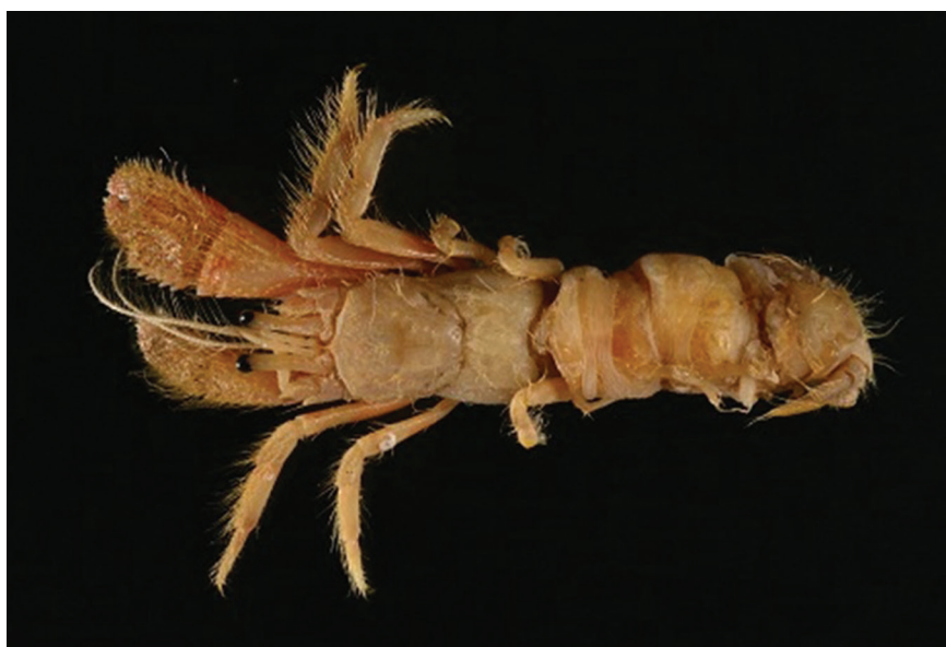
Fig. 3. Discorsopagurus tubicola Komai, 2003 (female, sl 3.51 mm). sl, shield length.

Description. Shield (Fig. 4A) as long as wide; rostrum triangular, terminating subacutely; lateral projection degraded, with small submarginal spine. Ocular peduncle 0.7 times