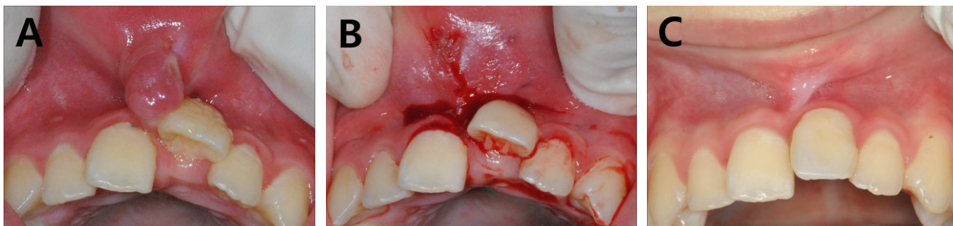
Fig. 2. Intraoral photographs of the patient. (A) Intraoral photograph showing a pedunculated mass on the labial mucosa. (B) Intraoral photograph taken immediately after the excisional biopsy. (C) Intraoral photo taken at the 8-month check-up visit, showing improved oral hygiene status and spontaneous reduction of labial inclination of the maxillary left central incisor by the force of the upper lip and perioral muscles without recurrence of the lesion.