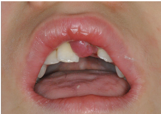
Fig. 3. Extraoral photograph showing an enlarged mass.

depth of the excision was at the level of the muscle fascia, such that the edges could be undermined for primary closure. The wound was closed with 4-0 sutures, and the biopsy specimen was immediately fixed in 10% formalin and sent for histological evaluation. Histological evaluation of the sections by light microscopy revealed a nodular mass of fibrous connective tissue covered by hyperparakeratinized stratified squamous epithelium (Fig. 4). The covering epithelium exhibited acanthosis with finger-like elongation of the rete ridges. Dense bundles of collagen fibers, arranged in a circular pattern with vascular hyperplasia and infiltration of inflammatory cells, were observed in the underlying connective tissue. On the basis of clinical and microscopic features, a final diagnosis of irritation fibroma was made.