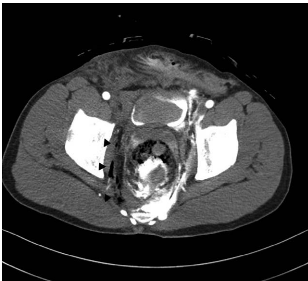
Fig. 2. Multifocal air densities (black arrowhead) and hematomas around rectum were detected on abdomen CT scan. Perirectal contrast was infused through foley catheter at previous hospital.

transferred to a secondary care hospital near his home after two weeks.