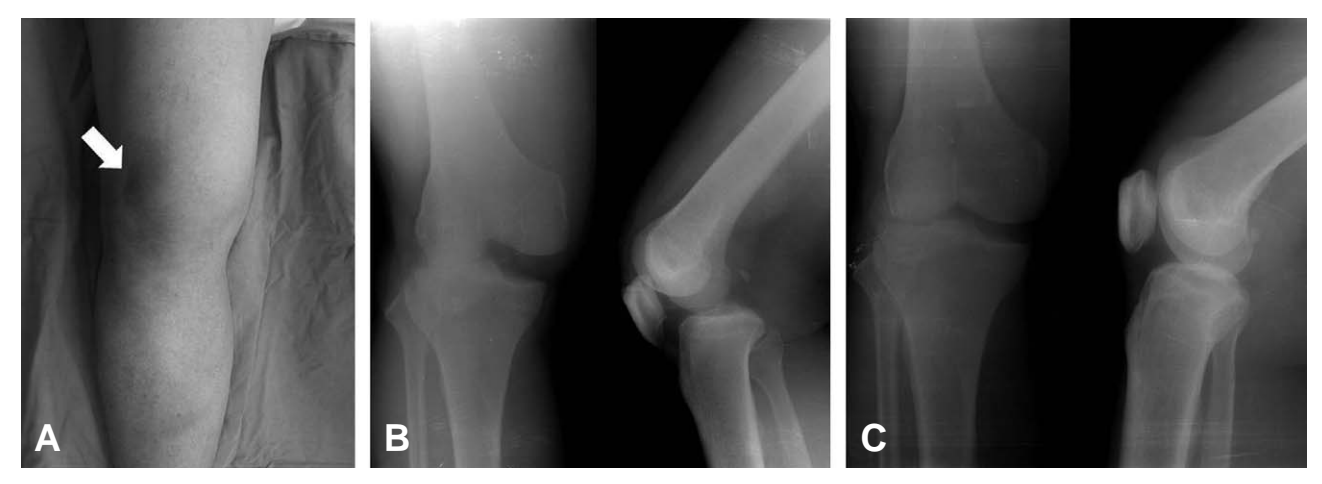
Fig. 1. Pre-operative clinical photograph and simple radiographs. (A) Clinical photograph showed characteristic dimpling of skin (dimple sign, white arrow). (B) Simple radiographs revealed widening of medial joint space, lateral and distal displacement of patella, and posteriorly displaced tibia (C) After closed reduction, patellar and tibial subluxation remained on simple radiographs.

ination. Radiographic examination revealed widened medial joint space, posterolateral dislocation of tibia