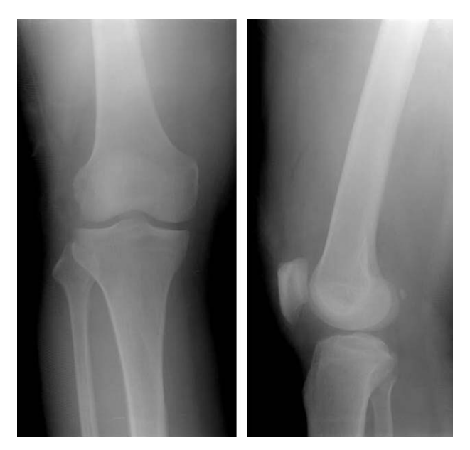
Fig. 4. Immediately post-operative simple radiographs. Complete reduction was achieved by removal of the muscle and fascia of the vastus medialis arthroscopically.

and lateral distal dislocation of patella (Fig. 1). After closed reduction in the emergency room, the widened medial joint space and location of the tibia were reduced, but there was still increased medial knee joint space and lateral distal dislocation of patella. We assumed it to be an irreducible knee dislocation with interposi – tion of the soft tissue and examined it with MRI (Fig.