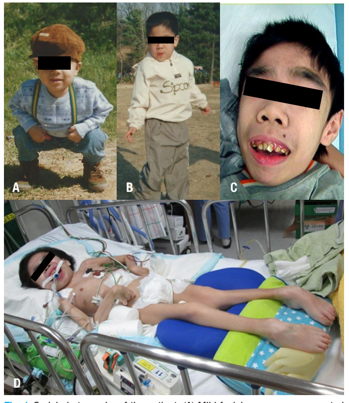
Fig. 1. Serial photographs of the patient. (A) Mild facial coarseness was noted at the age of 4 years. Facial dysmorphism, including coarse facial features, a depressed nasal bridge, prominent eyebrows, and malocclusion, was apparent at ages 13 (B) and 18 years (C). (D) He was bedridden and malnourished at the age of 21 years.

He revisited the center with aspiration pneumonia and motor dysfunction at 13 years of age (Fig. 1B). He exhibited behavioral problems such as aggressiveness, anxiety, and sleep disturbance throughout childhood. On opthalmologic examination, corneal clouding was absent at that time. The clinical symptomology including behavioral change, and progressive mental and motor deterioration had raised the suspicion of MPS III. Since then, motor and mental functions had progressively declined, thus he could not sit alone or walk. In addition, communication function has been lost. Epilepsy developed at 18 years of age (Fig. 1C) and he has been hospitalized due to recurrent epilepsy and pneumonia. We determined to make a confirmative diagnosis