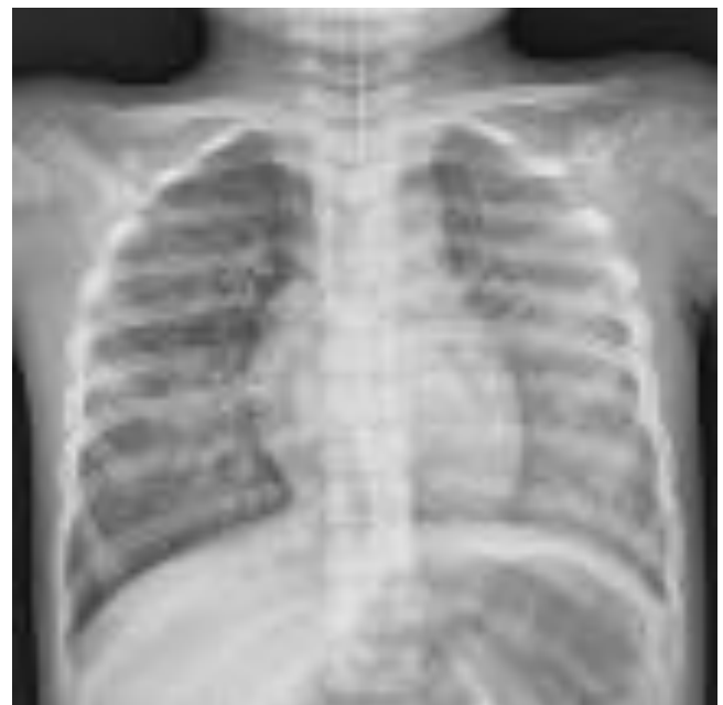
Fig. 1. Chest radiograph of a patient with enterovirus 71 infection presenting with pulmonary hemorrhage and shock. Note the diffuse haziness on both lungs.

Brainstem encephalitis is the most common neurological presentation, accounting for 58% of neurological manifestations, followed by aseptic meningitis (36%), and brainstem encephalitis with cardiorespiratory dysfunction (4%) 29 . Despite the recent discovery of receptors for EV71 in human cells 35,36 , the reason for the predominant involvement of the brainstem in EV71 infection is currently unknown. EV71 brainstem encephalitis occasionally induces autonomic dysfunction, such as fluctuating blood pressure and pulmonary hemorrhage/edema (Fig. 1). Most deaths caused by pulmonary hemorrhage in patients with EV71 brainstem encephalitis usually occur within 24 hours after admission because the disease rapidly progresses to the critical stage 2,37 .