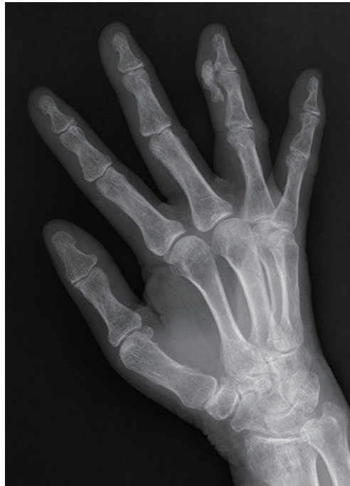
Fig. 3. One day after conservative treatment was initiated, simple radiographic findings showed a change from an ovoid calcification to a mottled appearance, which co-occurred with the dramatic alleviation of the symptoms.

believe that calcification may result from tendon hypoxia or a traumatic event [1]. Although it is a self-limited disease, in which periarticular calcification is eventually found to be resolved in radiologic imaging, it is often misdiagnosed, which can lead to unnecessary surgical intervention. It occurs most frequently in the shoulder and wrist, and least frequently in the hand, especially the phalanx [2-4]. We encountered a rare case of acute calcific tendinitis in a postmenopausal woman in the distal interphalangeal (DIP) joint and developed an appropriate management plan based on the correct