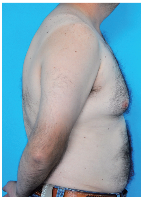
Fig. 1. Preoperative photograph with evident breast enlargement.

The histopathological analysis reported several samples in which stromal fibrosis with hyaline parts was found. Irregular ductal structures were identified, inlaid with hyperplastic epithelium following a