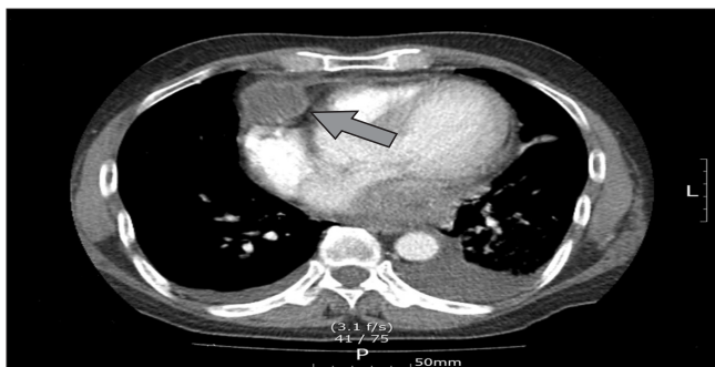
Figure 1. Computed tomography scan shows about 4 cm, peripheral enhancing, low density, probably necrotic, lobulating margin mass at right anterior cardiophrenic angle (arrow) and bilateral pleural effusion.

The most important treatment for respiratory nocardiosis is appropriate antibiotics therapy in combination with surgical drainage in patients with brain abscesses or empyema 10 . A high percentage of Nocardia isolates are sensitive to sulfonamide and trimethoprim/sulfamethoxazole, but resistance is common among N. farcinica and N. otitidiscaviarum 11 . Nevertheless, the sulfonamides are still first-line agents for treat-