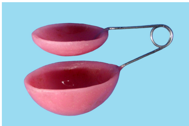
Figure 1. Mouth Exercising Device