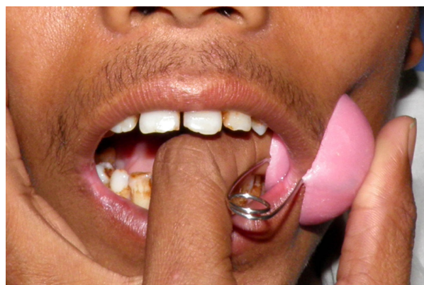
Figure 2. Patient Using Device