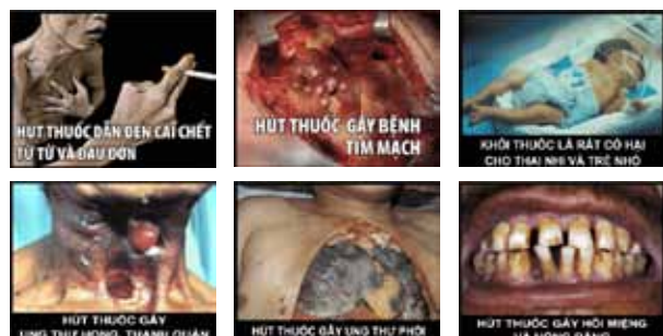
Figure 2. Pictorial health warning printed on cigarette packages in Vietnam since May 2013. From left to right, up to down: (1) Smoking leads to death slowly and painfully; (2) Smoking causes heart diseases; (3) Cigarette smoke is very harmful to fetus and young children; (4) Smoking causes throat and laryngeal cancer; (5) Smoking causes lung cancer; (6) Smoking causes bad breath and damaged tooth

As a result, WHO classified Vietnam as having the highest achievement on W-Warn about the danger of tobacco use in MPOWER package (World Health Organization, 2015a).