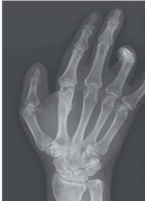
Fig. 3. After six months, no evidence of recurrence was present in a simple postoperative radiograph.

According to a review of the literature, it is very rare for epidermal inclusion cysts to occur in the joint. Strauchen and Strefling [4] reported a case of an epidermal inclusion cyst occurring after arthroscopic surgery in the knee joint. However, this case occurred in the knee joint. To the best of our knowledge, no cases of epidermal inclusion cysts occurring in the interphalangeal joint have been described.