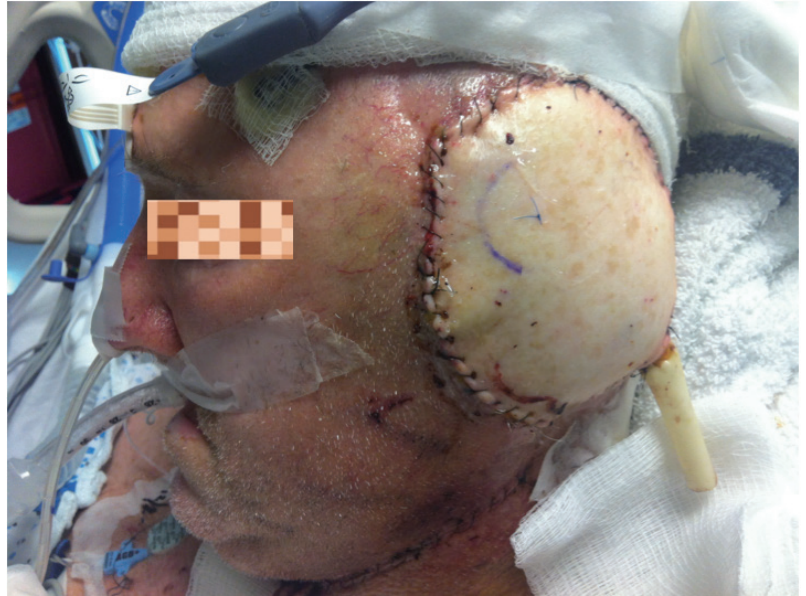
Fig. 2. A 69-year-old male underwent composite resection of the left auriculotemporal area and temporal bone for recurrent basal cell carcinoma, and the defect was reconstructed with a left vertical rectus abdominis myocutaneous free flap.

The effects of systemic hypothermia on free tissue transfer are not fully understood. Limited animal and human studies have demonstrated conflicting results. Some data have suggested that hypothermia causes decreased perfusion, vasospasm, and thrombosis, while other animal experiments have shown a protective effect of mild hypothermia on free flaps [3-5]. Clotting enzymes, platelets, and leukocytes function less effectively in a hypothermic setting;