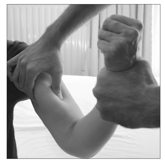
Fig. 2. This demonstrates the translation (medially in this case) which will occur with a relaxed biceps. This degree of translation will not be present in resisted flexion with an intact distal biceps tendon.