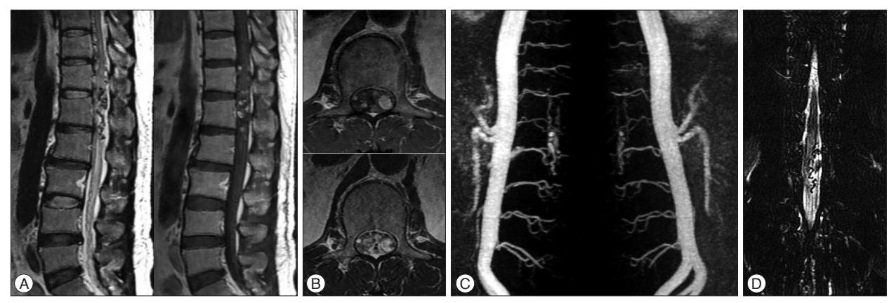
Fig. 1. Magnetic resonance imaging (MRI) of the thoracolumbar spine reveals abnormal lesions with signal void and enhancement, indicating a vascular anomaly at the T12, L1, and L2 levels (A). Axial images at the L1 level show a left-sided mass lesion in the spinal canal (B). Three-dimensional volumetric contrast-enhanced sagittal TRICKS abdominal magnetic resonance angiography (MRA) using 1.5T MRI system was performed. The study was post-processed into maximum-intensity projection images. These images show a feeding artery at the L1 level (C). Magnetic resonance myelography (anterior-posterior view) reveals a left-sided vascular anomaly (D).