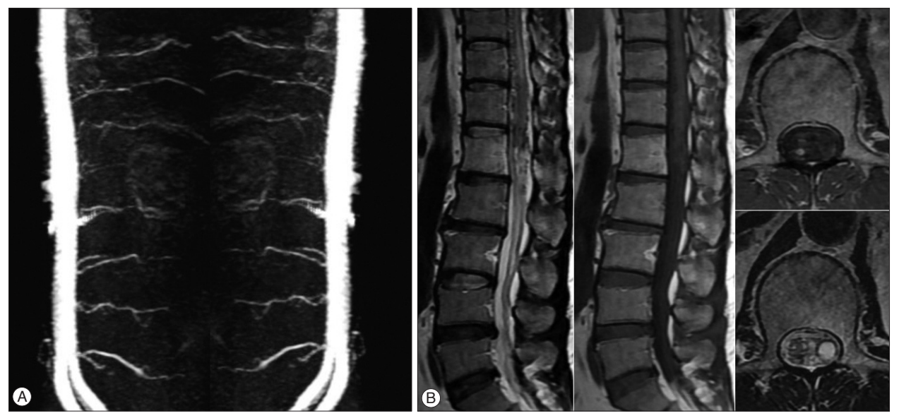
Fig. 3. Follow-up MRI and MRA images after 7 months. The size of the feeding artery and abnormal vascular lesion is decreased (A). The previous lesion with signal void and enhancement is also reduced (B).

Selective spinal angiography is regarded as an essential procedure to confirm and treat SDAVF<sup>5</sup>. For successful surgery or endovascular coiling, selective spinal angiography is necessary to know the architectures and hemodynamics of the lesion<sup>5,6,12,15,18,19,22</sup>. However, even with experienced neuro-interventionists, selective spinal angiography can sometimes cause complications from vasospasm, increased venous pressure, and spinal cord infarction<sup>6,8,12,15,17,20</sup>. In our case, the patient experienced paraparesis three times during spinal angiography. Although it occurred 14 years previously, the patient refused the spinal angiography. Because the patient wanted a noninvasive method for diagnosis and treatment, we found an imaging technique to provide information about the lesion and be available for follow-up. There