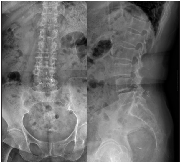
Fig. 1. Post-operative plain radiographs taken 5 years after DIAM insertion showed marked disc space collapse and scoliosis caused by left-side disc space collapse at L4–5, as compared to the immediate post-operative radiographs. Spondylolisthesis of L3 and L4 was also found. DIAM : device for intervertebral assisted motion.