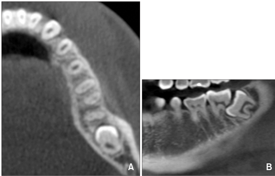
Fig. 4. Computed tomography images showing that more than half of the distal root of tooth #37 was affected by tooth #38 (A: axial view, B: sagittal view).

reason behind this 8) . The authors found that the activity level of the ongoing resorption was low and most of the root surfaces showed various stages of repair tissue formation. Indeed, the exposed pulp tissue showed a normal morphology, with loose connective tissue, blood vessels, and nerves. This suggests that the pulp may have regenerative potential under pressure root resorption, which is characterized by slow progression and the absence of infection. In this case, the patient responded positively to the pulp vitality test and the follow-up periapical radiographs showed signs of pulpal healing, such as pulp obliteration. Favorable alveolar bone repair following extraction of the impacted third molar could also have contributed to preserving the pulpal environment. Marmary et al. 9) found that the degree of bone healing is affected primarily by age, and was higher in patients under the age of 30, and that periodontitis, pericoronitis, and dry socket developed among the “failure-to-heal” cases after the extraction of impacted mandibular third molars. In summary, it is likely that our patient’s young age lead to desirable alveolar bone healing, which in turn protected against inflammation, thus keeping the pulp of the remaining tooth vital.