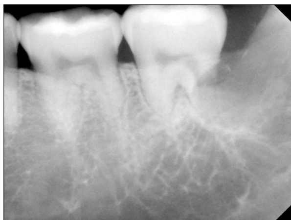
Fig. 1. Periapical radiograph of tooth #37 showing severe root resorption around the distal root of the tooth following extraction of tooth #38.

There are several factors that can affect root resorption of the mandibular second molar associated with the presence of the mandibular third molar: pressure, pericoronitis, periodontal disease of the second molar and a medical history of thyroidectomy and thymectomy 5) . In this case,