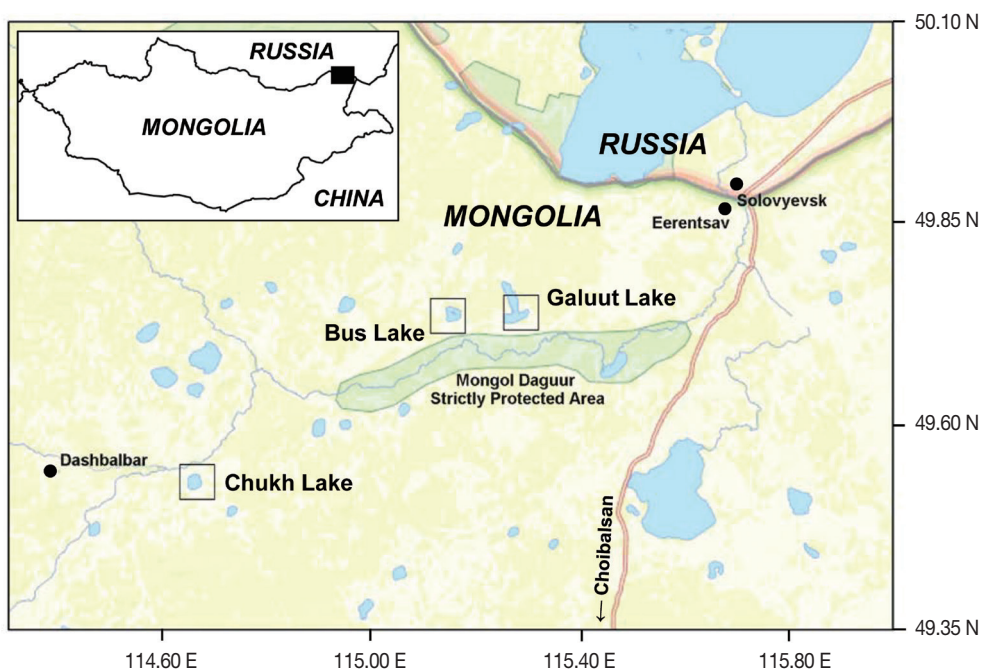
Fig. 1. Location of study sites in northeastern Mongolia where wild swan geese were sampled for parasitic lice in 2014.

From 27 to 31 July in 2014, we captured 14 swan geese at 3 lakes in northeastern Mongolia (Fig. 1) using standard dip-netting and corral trap techniques during the molting period [8,15]. We applied 70% ethyl alcohol to wet neck feathers for disease surveillance through blood sampling [15], and briefly searched head, neck, and breast of geese for lice running out of the plumage of the alcohol-applied and restrained geese.