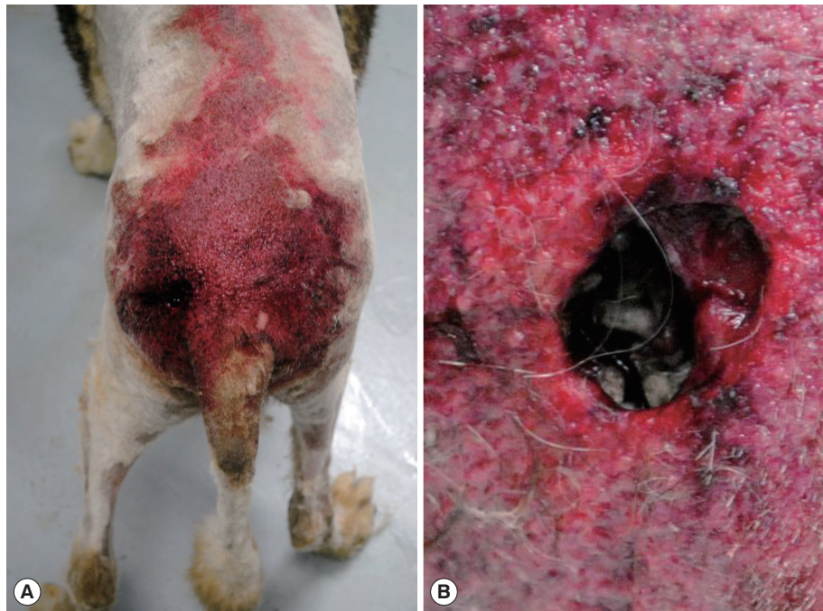
Fig. 1. Outlook of the case. (A) Overview of the wound. (B) Wound crowded with maggot swarm.

maggots were removed using forceps, and the affected area was sponged with gauzes and disinfected with 70% alcohol and a povidone-iodine solution every day. Due to the wide range of skin and tissue loss, wound closure was not available. We left the wound open until the region recovered sufficiently for suture. The patient recovered and was discharged at day 19 after admission.