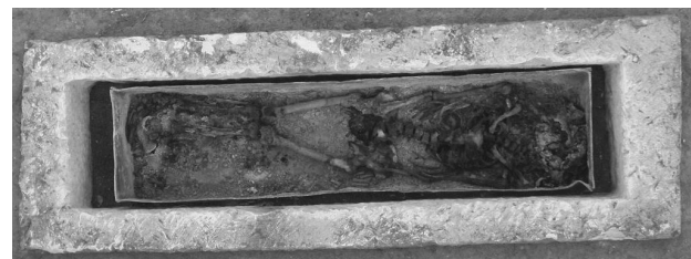
Fig. 2. South sarcophagus F293 with the individual in the lead coffin.

Only 1 individual yielded positive results. The analysis of sediment taken from the surface of the sacrum of the individual in coffin F293 (sample JC_FC_689, Table 1) revealed the presence of 2 ovoid eggs, characterized by 2 polar plugs giving them a characteristic lemon shape (Fig. 3). Egg sizes without polar plugs were 46.4 \mu m long and 25.2 \mu m wide for the first (Fig. 3A) and 54.5 \mu m long and 26.4 \mu m wide for the second (Fig. 3B). Because of the size (consistent with current data) and the archaeological context, these eggs were identified as