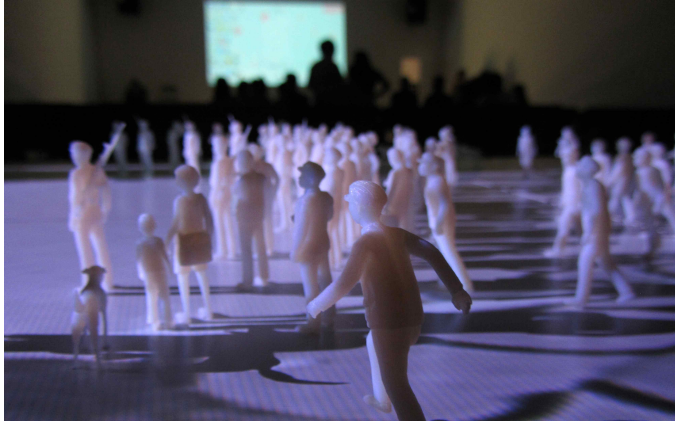
Photo 4: Ketchup was expanded into an installation of 3D prints and projection mapping. The characters in the 3D animation of Ketchup were printed as plastic figures, and sometimes we feel confused: who are the audience - us or them? 39)

To recall every detail in these events, we used the method of summoning “episodic memory. In this way the whole process of production required Baishen to frequently put himself back into the year of 1984.