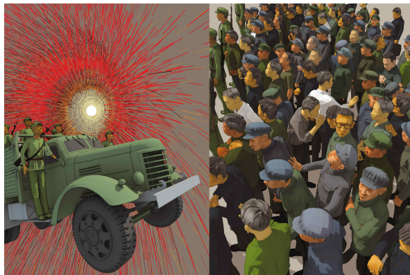
Photo 3: the still images of Ketchup, representing the memories from a boy's perspective of China in 1984.