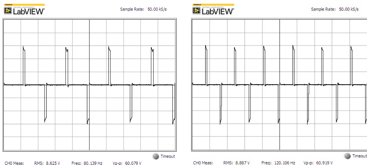
Figure 3. Stimulation output voltage (Left : Frequency : 80Hz ,Vpp : 60V , Right: Frequency : 120Hz Vpp : 60V)

Our vagus nerve stimulation system can generate the sound removed from the tinnitus frequency bandwidth of patient on the basis of an algorithm implementation and control the biphasic electrical stimulation range from 20V to 150V and from 25 Hz to 120 Hz at the same time. By using the switch, it is possible to adjust the frequency and amplitude easily. VNS system generates the output waveform based on the PWM waveform generated from the MCU. There are two examples. According to figure 3, left figure is a waveform with 60V and 80Hz, and right figure is a waveform with 60V and 120Hz. The frequency was adjusted by setting the sampling frequency and the amplitude was generated by adjusting the pulse width of the PWM waveform.