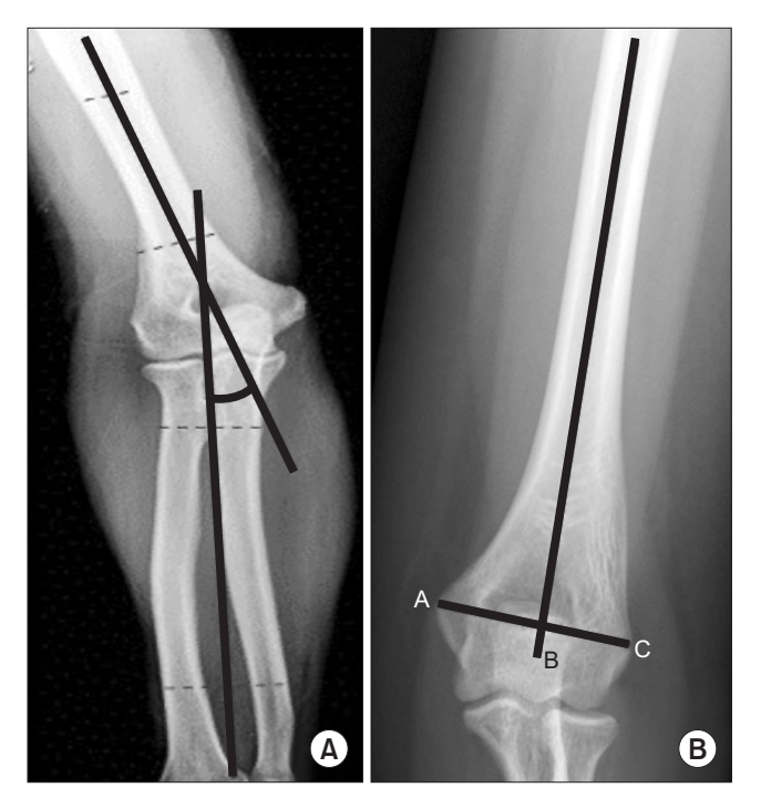
Fig. 1. (A) Measurement of the humerus-elbow-wrist angle, using the angle of intersection of the humeral shaft line and the forearm line. (B) Lateral prominence index (%), calculated as (BC-AB)/AC×100.

The pre- and postoperative anteroposterior radiographs of both elbows were obtained, with the elbows fully extended and the forearms supinated to obtain the humerus-elbow-wrist angle (HEWA).<sup>3)</sup> The HEWA was measured using the angle of intersection between the humeral shaft line and the forearm line. The humeral shaft line connects the midpoints of the two transverse humeral lines, which connect the medial and lateral cortices of the humerus at the diaphysis and distal metaphysis levels. The forearm line connects the midpoints of the two transverse forearm lines, connecting the medial cortex of the ulna and the lateral cortex of the radius at the radial tuberosity and distal radiusulnar diaphysis levels (Fig. 1A). The necessary corrective angle was estimated using the difference between the carrying angles of the normal and deformed elbows. The lateral prominence index (LPI) was measured on pre- and postoperative anteroposterior radiographs.<sup>20)</sup> LPI was defined as the difference between the medial and lateral widths of the distal part of the humerus, from the longitudinal mid-humeral axis, and it was expressed as a percentage of the total width of the distal part of the humerus (Fig. 1B). The medial prominence index (MPI) was measured for cubitus valgus. MPI was calculated as the same as LPI. The existence of osteotomy site extension or flexion was confirmed