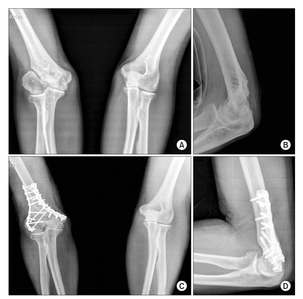
Fig. 4. (A, B) A 42-year-old male with cubitus valgus deformity and nonunion of lateral condyle on his right elbow. (C, D) At postoperative 2 year, bone union of lateral condyle was confirmed following in situ screw fixation with minimal soft tissue dissection.