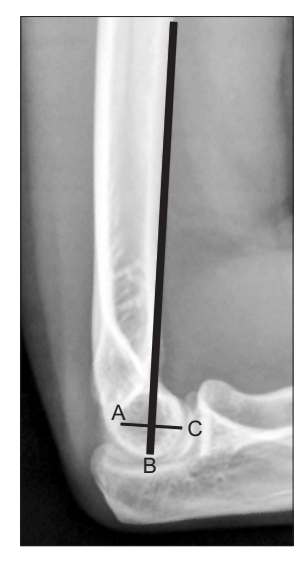
Fig. 2. Measurement of distal humerus angulation index (DHAI) is used to confirm the existence of osteotomy site extension or flexion. DHAI is defined as the distance from the anterior cortical line of the distal humerus (B) to the anterior cortex of capitellum (C), and is expressed as percentage of total width of capitellum from posterior cortex (A) to C (BC/AC×100).

by measuring the distal humerus angulation index (DHAI), which was modified from Gartland classification.<sup>21)</sup> The DHAI was defined as the distance from the anterior cortical line of the distal humerus to anterior the cortex of capitulum, and it was expressed as a percentage of the total width of capitulum using the radiographs of the lateral elbow (Fig. 2). Surgery was performed by one experienced senior author (HBP). Radiographic factors were measured by one orthopaedic fellow (JYG) and the mean