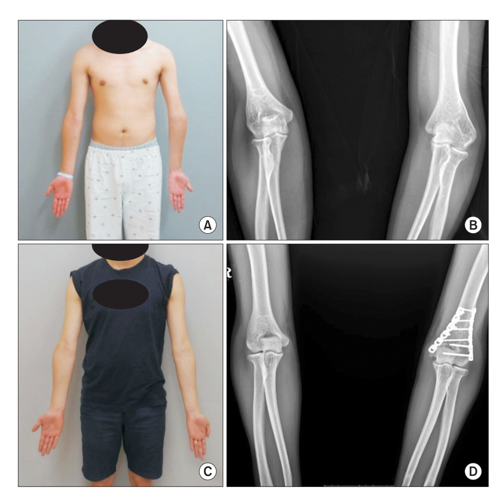
Fig. 5. (A, B) A 21-year-old male with cubitus varus deformity on his left elbow (humerus-elbow-wrist angle [HEWA]: varus 6.0°). (C, D) Four years after supracondylar dome osteotomy, HEWA is corrected to valgus 7.4° without any complications.

infection, inadequate correction, and vascular compromise. This current study differs from the study by Kumar et al.<sup>8)</sup> as we used double plating instead of K-wire fixation as the fixation method and we did not observe any of the mentioned complications through the follow-up period. The postoperative ROM could be an important factor in determining the outcome of dome osteotomy. Kumar et al.<sup>8)</sup> mentioned that after dome osteotomy, extension of osteotomy site can lead to postoperative limitation of flexion and less tolerable results. In the current study, the mean postoperative ROM of ten patients decreased from 133.00^{\circ} \pm 15.49^{\circ} to 129.50^{\circ} \pm 15.71^{\circ} . However, decreased ROM did not compromise the outcome results. Moreover, postoperative extension of the osteotomy site was confirmed in five patients and they did not have the decrease in ROM, unlike those in Kumar et al.'s result.<sup>8)</sup> As for the decrease of postoperative ROM in the current study, osteosynthesis of lateral epicondyle could be contributing factor. Kim et al.<sup>13)</sup> and Masada et al.<sup>22)</sup> suggested that osteosynthesis of the lateral condyle could lead to complications, including decreased elbow ROM by extensive soft tissue dissection and mobilization of the lateral condyle fragment. In this study, we performed condyle osteosynthesis to three patients who have pain in the lateral condyle. Even though