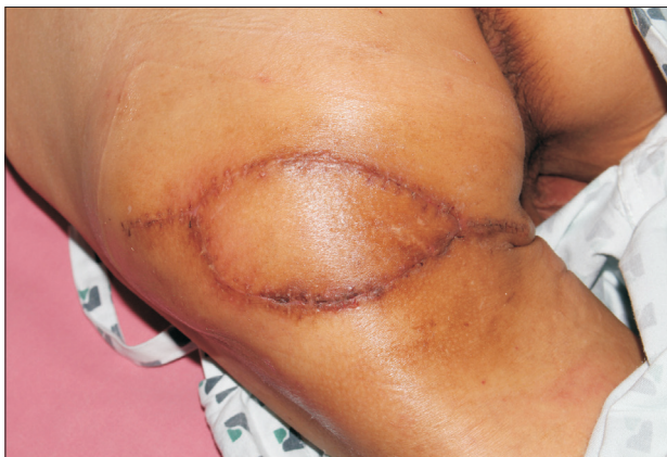
Fig. 4. Postoperative 1 month.