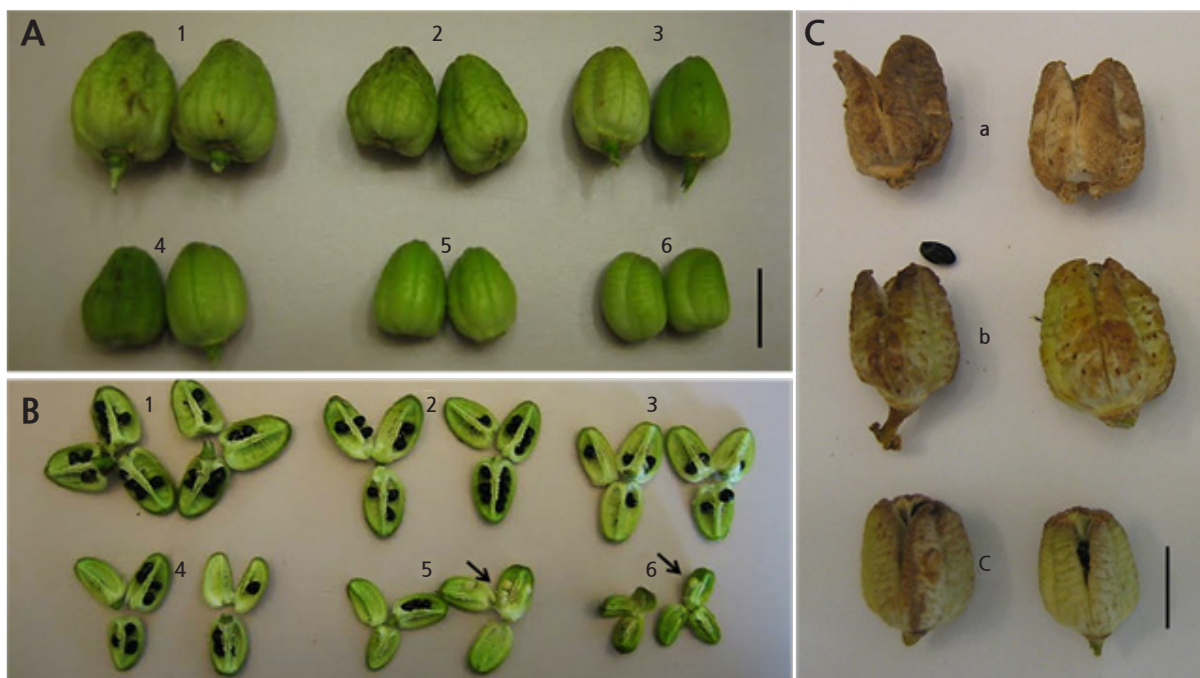
Fig. 2. Various sizes of capsules and seed development of Hemerocallis 'Stella de Oro'. Capsules were harvested on Aug. 7 (A and B) and on Aug. 27 (C). Capsules were assigned to categories 1 through 6 based on age, where 1 through 6 represent 35-40 days after anthesis (DAA), 30-35 DAA, 25-30 DAA, 20-25 DAA, and 15-20 DAA (two different sizes), respectively. Capsules prior to splitting (A) capsules split open, showing seeds along the placenta (B), and capsules harvested on Aug. 27 (C) that were split; a = seeds were dispersed and capsules are empty, b = seeds separated from the placenta and are easily removed from open or split capsules, c = capsules beginning to split, showing seeds inside the capsule. Bars = 2 cm.

Seeds from mature and immature capsules (Fig. 2) were glued (50 seeds) onto a 8 \times 15 cm card using a white multi-purpose glue and imaged at the Ornamental Plant Germplasm Center (Columbus, OH, USA) using a Faxitron MX-20 (Faxitron Corporation, Wheeling, IL, USA). Seeds were exposed to 20kV for 15 seconds and X-ray digital images were collected. Seeds showing various stages of development of embryo and endosperm were selected and classified in categories A through E based on the X-ray images (Fig. 3), where seeds in category A exhibited no endosperm or embryo formation (empty) and seeds in category E exhibited fully developed endosperm and embryo. After imaging, the seeds were mailed to Dankook University and sown for germination tests as described in the germination testing section.