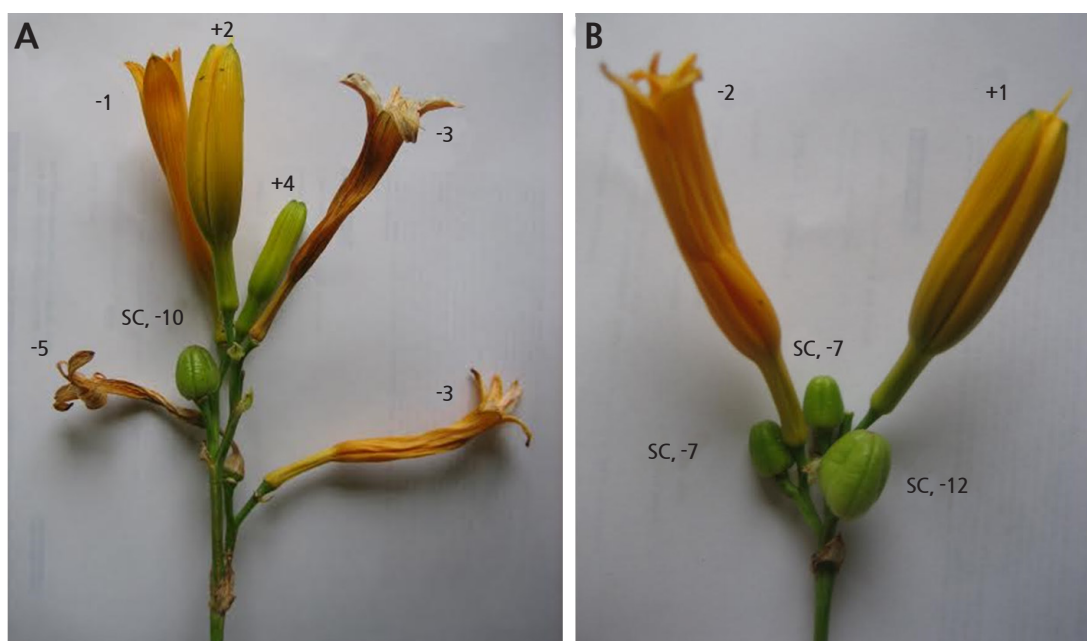
Fig. 1. Development of flower buds and seed capsules of Hemerocallis ‘Stella de Oro’ in branched scape (A) and non-branched scape (B). Based on anthesis day 0, flowers that were open 1, 3, and 5 days ago are indicated as -1, -3, and -5, respectively, and flower buds that will open in 2 and 4 days are indicated as +2 and +4, respectively. Capsules developing 7, 10, and 12 days after anthesis are indicated as -7, -10, and -12, respectively. The scape normally branches as it develops so that the buds are not all present at the top of the scape.

It is difficult to evaluate the maturity of seeds using methods other than germination testing. Magnetic resonance imaging revealed that Styrax japonicus Siebold & Zucc. seeds should be harvested 8 weeks from anthesis to improve the germination percentage (Horimoto et al., 2011). However, this technique requires the use of a sophisticated instrument, and it is difficult to screen many seeds at the same time. With Corylopsis , an immersion test in water was used to separate mature and viable seeds from immature and non-viable seeds. However, immersion of Hemerocallis seeds in water did not separate full and viable seeds from empty seeds. Therefore, X-ray imaging could be employed as an alternative method. Seeds of Pinus nigra ssp. pallasiana (Lamb.) Holmboe that sank after immersion in 96% ethanol had higher germination rates than those that floated. Similar results were found with Casuarina equisetifolia L. seeds dipped in petroleum, and X-ray imaging analysis