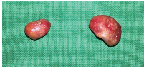
Fig. 3. The masses were excised without rupture, and the right mass was slightly larger than the left one.

Bilateral facial masses are not commonly encountered. If there are symmetrically bilateral