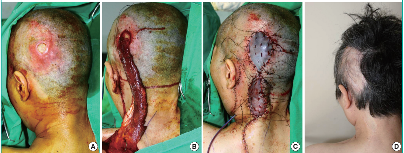
Fig. 2. Posterior neck defect (case 2, patient 10)

A 62-year-old woman presented with a skin and soft tissue defect involving an exposed implanted cranioplasty prosthesis (Medpor) on her posterior scalp. (A) The defect size was 4 \times 4 cm 2 . The exposed cranioplasty prosthesis was visible through the wound opening. (B) Following massive debridement due to a surrounding infection, a 27 \times 6 -cm 2 trapezius muscle flap based on the superior cervical artery was elevated and transferred to the defect without subcutaneous tunneling. (C) The flap donor site and posterior neck incision for flap placement were closed with minimal subcutaneous undermining. An autologous split-thickness skin graft was laid on the remnant skin defect above the exposed muscle flap. (D) Seventeen-month postoperative results showing not only healing of the trapezius muscle flap and overlaid graft but also contouring with adequate thickness and good harmony with the surrounding tissue.