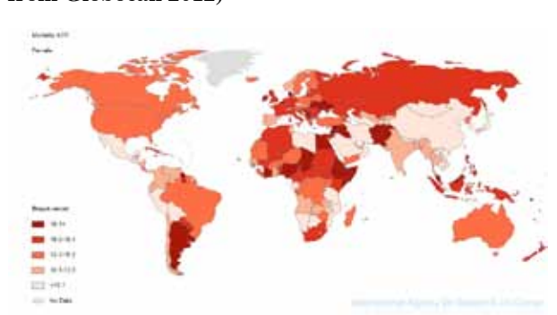
Map 2. Distribution of Standardized Breast Cancer Mortality Rates in World in 2012 (extracted from Globocan 2012)

mortality rate (per 100,000)were Fiji (28.4), Bahamas (26.3), Nigeria (25.9), FYO Macedonia (25.6), and Pakistan(25.2), respectively (Map2).