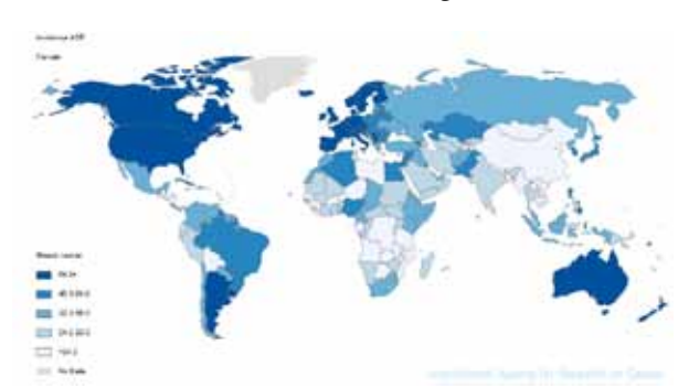
Map 1. Distribution of the Standardized Incidence Rate of Breast Cancer in World in 2012 (extracted from Globocan 2012)

The five countries with the highest standardized