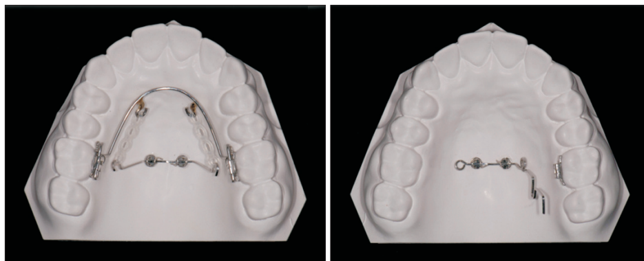
Figure 1. Midpalatal miniscrew assisted maxillary molar distalizer. Right, lingual arch-type appliance; Left, pendulum type appliance

The lingual arch type of biomechanical system utilizes a lingual arch (0.8–0.9 mm) connecting the right and left first molars with hooks soldered onto the mesial part (Figure 1). A rectangular wire with hooked ends is inserted into the miniscrews' rectangular slots to connect two midpalatal miniscrews (Figure 1). Elastomeric chain or coil springs are engaged between the lingual arch hook and midpalatal miniscrew connecting wires to deliver a distalizing force to the molars. By adjusting the vertical length of the midpalatal miniscrew connecting wires, the maxillary molar distalizing pattern can be controlled: shorter lengths (hooks placed near the palatal roof) can provide greater root distalizing movement, while longer lengths (hooks placed near the tooth crown) can provide greater crown distalizing movement. In all of the cases included in the present study, the midpalatal miniscrew connecting wires and the lingual arches were adjusted to direct the distalizing force vector