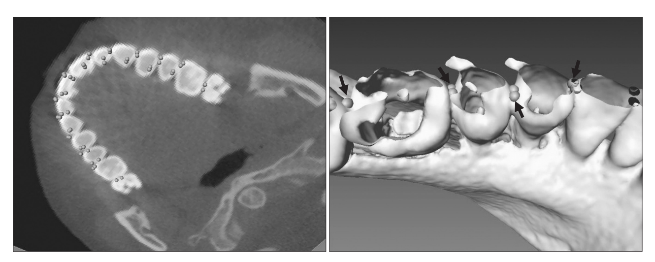
Figure 3. Landmarks represented by arrows on a cone-beam computed tomography (CBCT) slice (left) and a digitally bisected three-dimensional model obtained from the CBCT scans (right) using Avizo software (standard edition version 6.0; Mercury Computer System Inc., Chelmsford, MA, USA).

Figure 2. Mesiodistal tooth width automatically calculated after digital separation of the teeth and automatic facial axis detection using Ortho Insight three-dimensional software (Motionview Software LLC., Hixson, TN, USA).