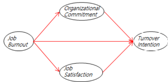
[Fig. 1] Research Model

In [Fig. 1], the model has been developed and analyzed to figure out the effects of job burnout on organizational effectiveness.