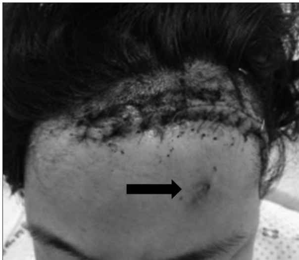
Fig. 3. The post-operative photo showing the totally removed mass (arrow) and suture line.