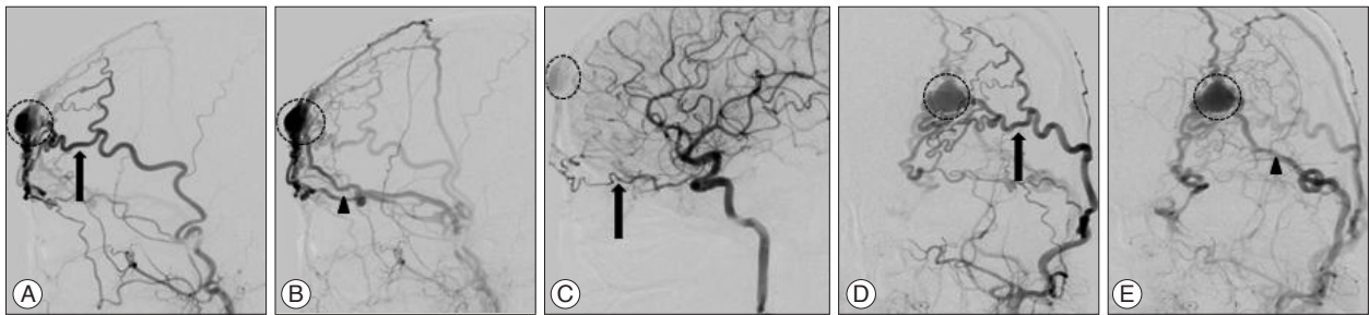
Fig. 2. Digital subtraction angiographic images depicting the arteriovenous fistula : selective left external carotid artery from which the left superficial temporal artery comes (arrow) and drains itself mainly through the fistula (dashed circle) into multiple large superficial temporal veins (arrowhead). A and B : Lateral views. D and E : Front views. C : Lateral view of the left internal carotid artery showing feeding artery from branch of left ophthalmic artery (arrow).