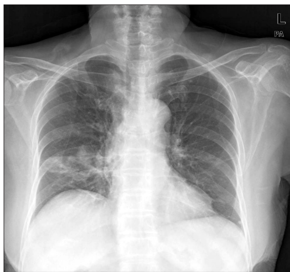
Figure 1. A chest radiograph revealed an ill-defined consolidation in the right lower lung fields and fibrotic change in the right upper lung fields.

buninemia (3.0 g/dL), and elevated C-reactive protein levels (12.26 mg/dL). Three acid-fast bacilli tests of sputum were negative. A chest radiograph showed an ill-defined consolidation in the right lower lung fields and fibrotic change in the right upper lung fields (Figure 1). Computed tomography (CT) scans of the chest showed multiple, ill-defined nodules in the right middle lung and multiple variable-sized mediastinal lymph nodes (Figure 2A). In addition, CT scans of the chest showed an irregular cavity that communicated from the right