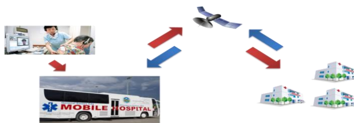
Figure 4. Clinical conference system

Other users may browse the recorded charts of patients on the server in case that a patient uses other mobile hospital vehicles. The necessary information for the medical treatment of patients such as the name of a disease, visitation date, and prescription can be adjusted via browsing by other users.