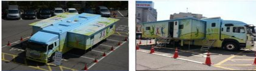
Figure 1. Mobile Hospital Vehicles

areas as well using a portable technology via a moving vehicle. It is about building mobile hospitals equipped with various medical devices for the medical treatment of patients.