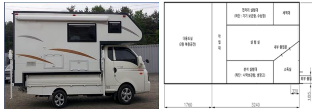
Figure 5. Exterior and Interior View of The M-LIMS

Figure 5 shows the exterior and the interior blueprint of M-LIMS. The doctor's office can be set up at the space behind the car, and medical equipment are installed in the space. The equipment is utilized by selecting a specific area of medical treatment rather than utilizing various equipment for the enhancement of spatial efficiency.