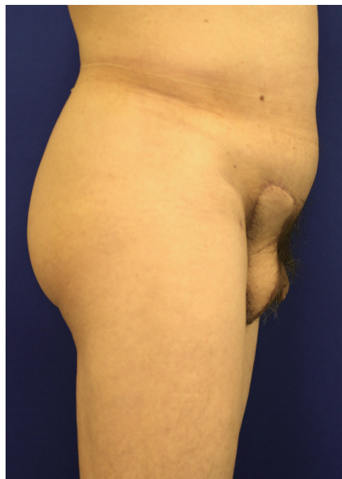
Fig. 5. This figure contains a lateral view three months after the operation showing that the wounds had healed well and that a good aesthetic result was achieved.

Second, by choosing the pedicled ORAM flap over the pedicled ALT flap, we were able to raise the ORAM flap simultaneously on the contralateral side