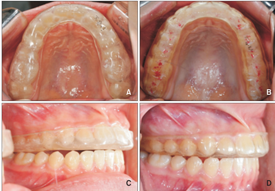
Figure 3. Clinical application of the multi-layer vacuum-formed retainer (VFR) in a patient with bruxism. A, De-bonding (delivery of the multi-layer VFR). B, One-year after retention. The form and function of the VFR was well maintained.