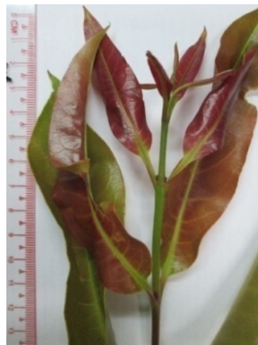
Figure 1. Cratoxylum formosum Subsp. Pruniflorum (Kurz.) Gogel.

After incubation for 24 hrs, the existing media was removed and cell viability was detected by neutral red (NR) uptake assay. The pre-filtrate NR media (0.066 mg/mL) was passed through a 0.22 µm pore size filter and 200 µL of this solution was pipetted to each well in the plate. They were incubated for 3 hrs and then media was removed. Phosphate buffer saline (PBS) pH 7.4 was used for washing the cells for 2 times and 200 µL of lysis buffer (50% methanol and acetic acid at a ratio of 99:1)