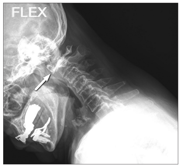
Fig. 1. Lateral flexed cervical radiograph showing atlantoaxial instability (arrow).