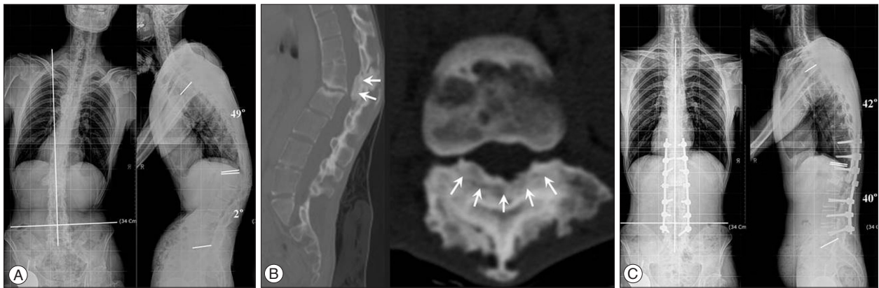
Fig. 2. A 33-year-old man with kyphotic deformity. A : Anteroposterior and lateral preoperative radiograph showing severe kyphotic deformity and coronal imbalance. B : Preoperative CT showing hypertrophied facet joints and severe ossification of ligamentum flavum (arrows). C : Anteroposterior and lateral postoperative radiograph showing improvement of the kyphotic deformity and coronal imbalance.

closure without a technical difficulty. However, in the 6 cases mentioned on results, dural tears were characterized by dural defect due to spinal canal encroachment of hypertrophied facet joint and ossified ligamentum flavum, which was very closely adherent to dura as to even erode it. Direct repair of such defects were inadequate owing not only to its size, shape, and the friability of dura matter surrounding the defect, but also to the inherent inflammatory characteristics of ankylosing spondylitis. Then, Eismont et al. 10) recommended muscle, fascia or fat graft secured by interrupted sutures in the treatment of larger dural tears (defects). We also used muscle, fascia or fat graft to repair the larger dural tears (defects) in six patients.