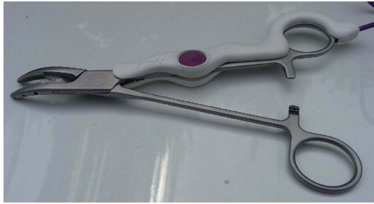
Fig 1. The LigaSure max hand switching instrument (LS3090, Covidien, USA) is a reusable vessel sealing instrument and disposable electrode.

Co., LTD., Korea) was administered via the venous catheter at a rate of 10 ml/kg/h.