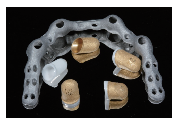
Fig. 1. Components of the CGDC restoration: milled and polished primary zirconia crowns, electroplated secondary crowns, and cast framework.

fracture rates and therefore was later replaced with yttriastabilized zirconia polycrystals (Y-TZP or zirconia).<sup>15</sup> Subsequently, conical crowns with zirconia primary crowns and electroplated copings as female parts have been evaluated in several in vitro studies.<sup>16-18</sup> The CGDCs demonstrated clinically acceptable mean retentive forces and reduced excursive retentive force development compared with cast double crown systems.<sup>17,18</sup> The retentive force was influenced by the abutment height and the taper. It was concluded that zirconia primary crowns with a sufficient height and 2° taper can serve as an alternative to gold alloy primary crowns.<sup>16</sup>