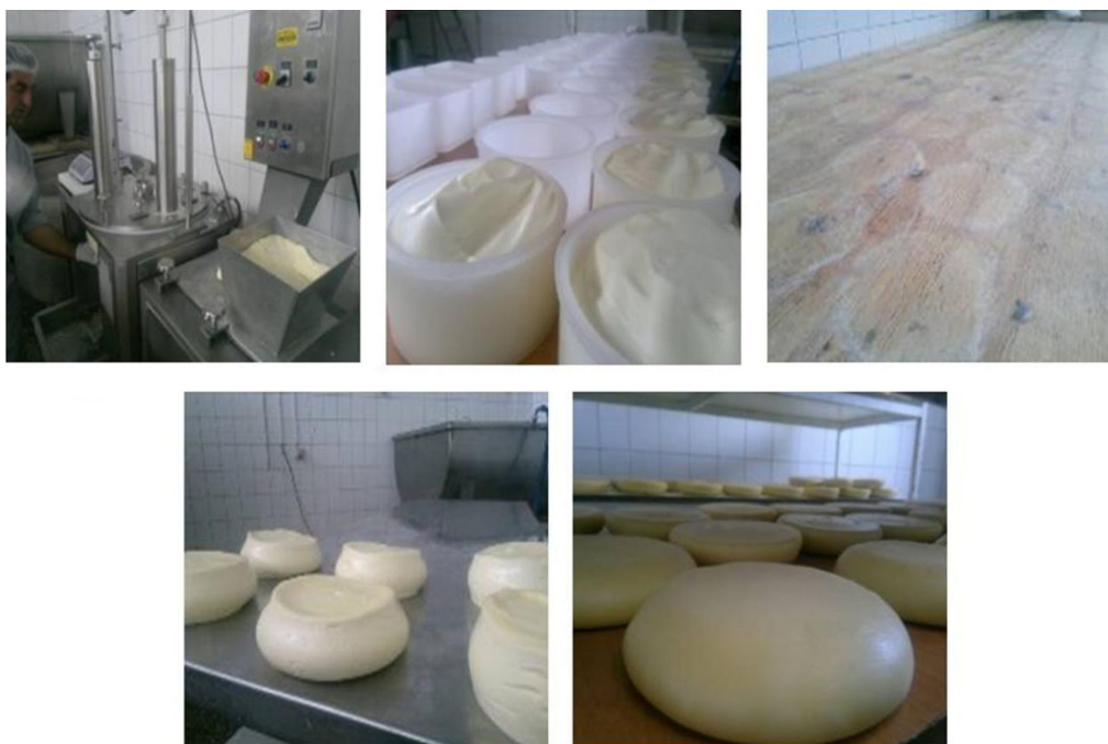
Fig. 1. The production of Göbek Kashaar cheese.

wheel using sterile gloves and the sample groups were subjected to microbiological analysis. For each sample, 11 g cheese was taken and diluted in 99 mL of 0.85% (wt/vol) sterile saline solution. After that, a Stomacher (Lab. Stomacher Blander 400 BA 7021, Swardmedical) was used to homogenise the samples in a sterile polyethylene bag for 1.5 min. Sterile 9 mL 0.85% (wt/vol) NaCl was used for dilution and the number of total aerobic mesophilic bacteria (TAMB; Merck, at 30\pm 1^\circ\text{C} for 72 h; Ozdemir and Sert, 1996); lactic acid bacteria (in MRS; Merck, at 30^\circ\text{C} for 48 h in anaerobic conditions; Diliello, 1982); lactic acid bacteria (in M17; Merck, at 30^\circ\text{C} for 48 h; Sert et al. , 2007); coagulase-positive Staphylococcion Baird–Parker agar with egg yolk tellurite enrichment (Merck, at 37^\circ\text{C} for 24 h; Ozdemir and Sert, 1996); coliforms (Violet Red Bile Agar, Oxoid, at 35\pm 2^\circ\text{C} for 48 h; Diliello, 1982) and moulds (Potato Dextrose Agar, Oxoid, at 25^\circ\text{C} for 5 to 7 d; Koburger and Marth, 1984) were counted.