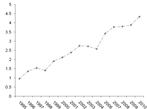
Figure 1. Trend of Breast Cancer Mortality During the Period 1995-2010 per 100,000